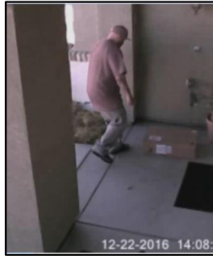
Package Theft Suspect