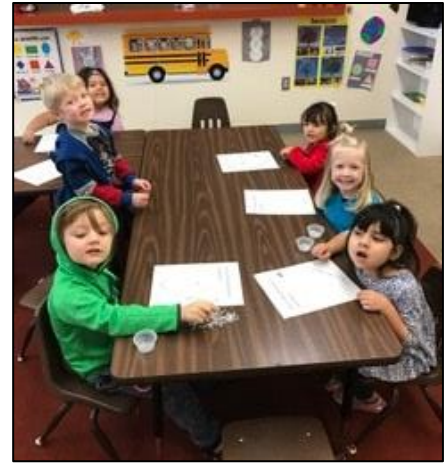
Little People’s participants working on tracing letters

child for one day a week, or a combination of days. There are daily craft projects, snacks, sharing and story time. Mom/Dad and Me is a stepping-stone to Creative Play and requires parent participation.