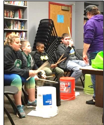
Drum Bucket Beats class participants