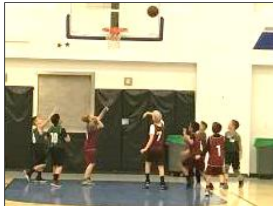
Youth Basketball League action