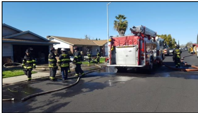
Firefighters on scene of a garage fire on Sonora Avenue

Firefighters responded to the report of a structure fire on Sonora Avenue Saturday afternoon. Upon arrival, firefighters found smoke coming from the garage. Firefighters met with the occupant and confirmed that everyone was out of the structure. Utilities were secured as firefighters established a water supply. The initial fire attack began through the windows of the garage door until the door could be cut and removed. Firefighters entered the structure from the front door with a second attack line to extinguish the fire. Once the fire was extinguished, firefighters checked for extension and began overhaul/salvage operations. The total fire loss from this incident is estimated to be $97,000.