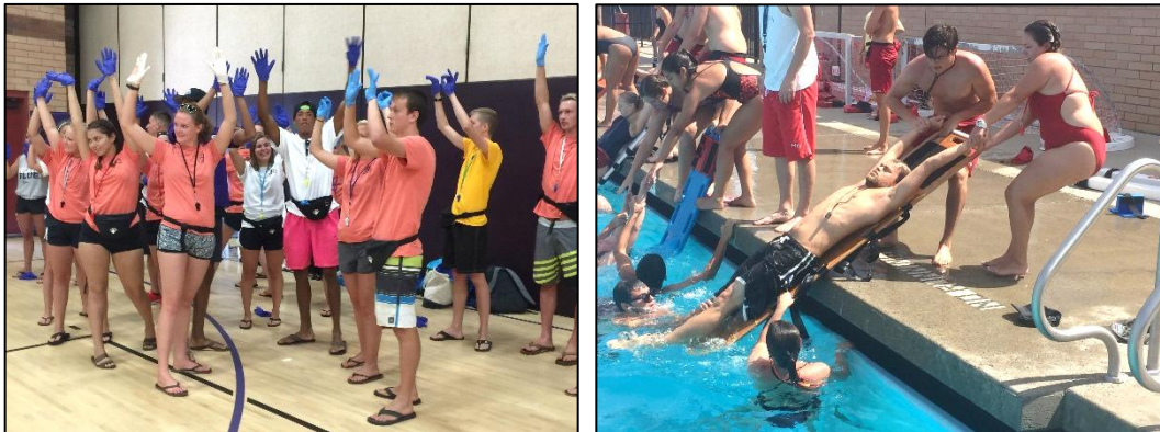
2016 Lifeguard Training