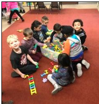
Little People's participants with their Valentine's Day artwork, left, and hard at play.