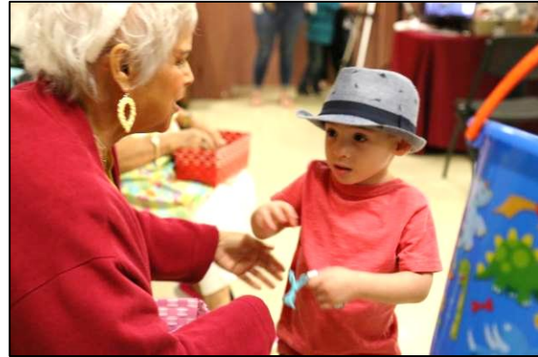
Breakfast with the Easter Bunny, Manteca Senior Center – April 8, 2017