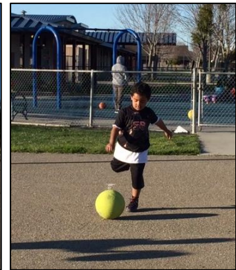
Kids' Zone After-School program participants staying active outdoors!