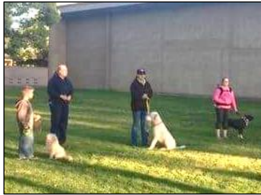
Beginner Dog Obedience class participants