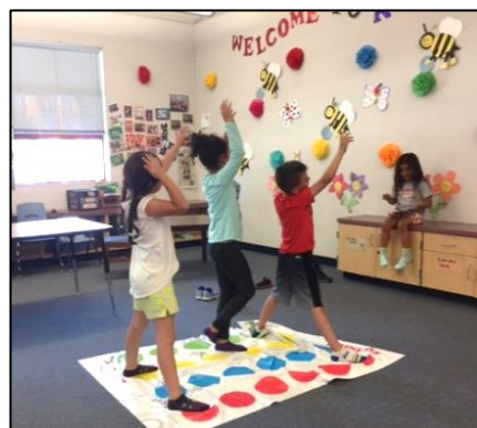
Kids' Zone participants enjoying free time