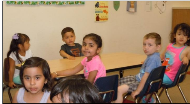
Little People's participants